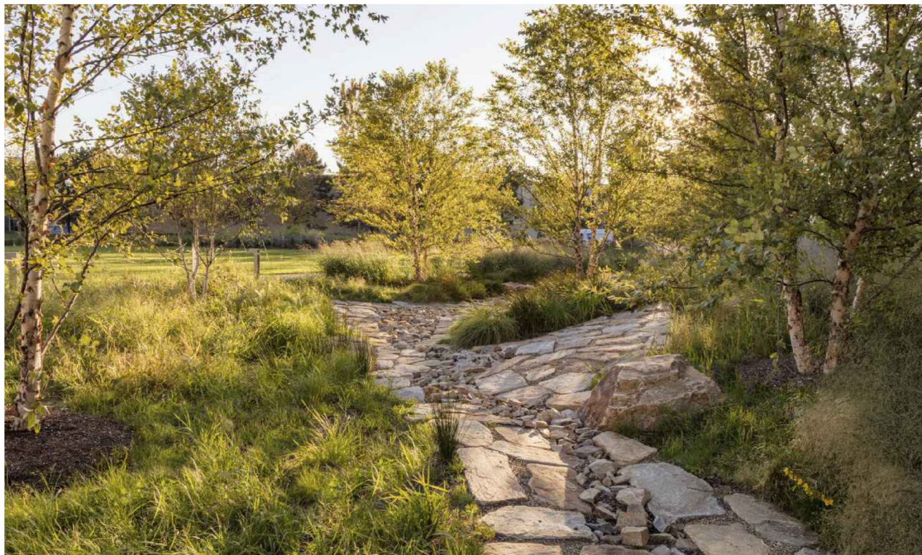
4 STORMWATER POND REFERENCE IMAGE SCALE: NTS